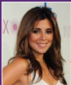
Jamie-Lynn Sigler styled by FHI Heat

Step 4. As the final touch, Ruth used FHI Heat's 1 1/4" Curling Iron with a touch more Hot Sauce run through the ends of Jamie's hair. The result: Soft and wavy, beach-inspired hair - made effortless by FHI Heat .